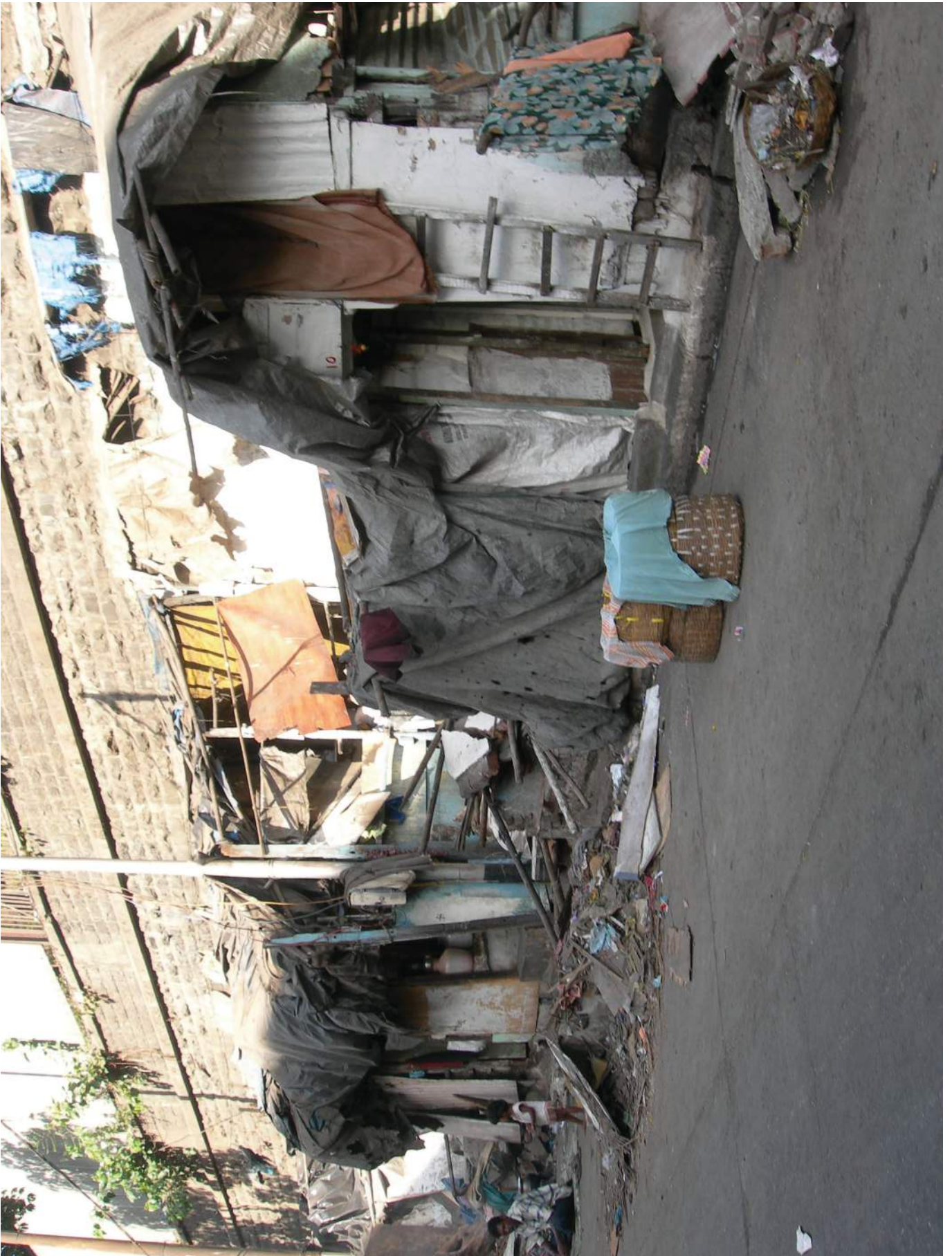
Fig. 2.2 for Question 2